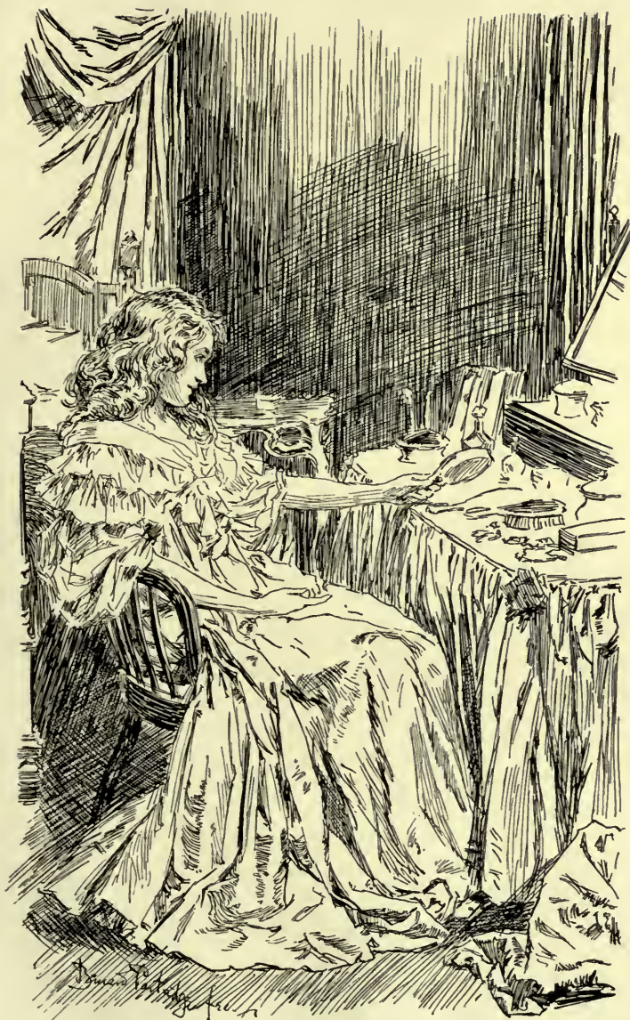
For a moment, she laid down her brushes.